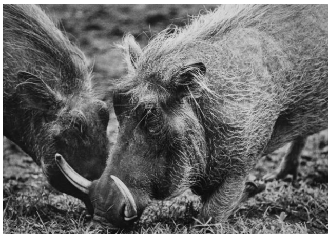
Warthogs Foraging Graham Burstow