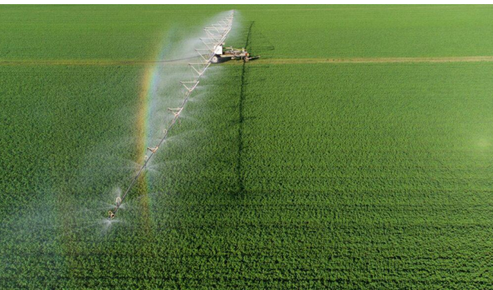
Rainbow in Water Jason Wheeler