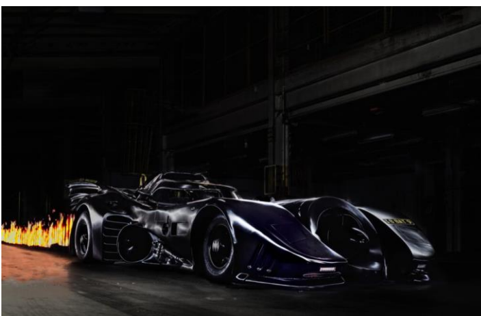
Bat Mobile Veronica Sorley