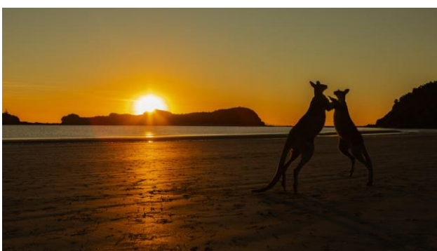
Boys Will Be Boys