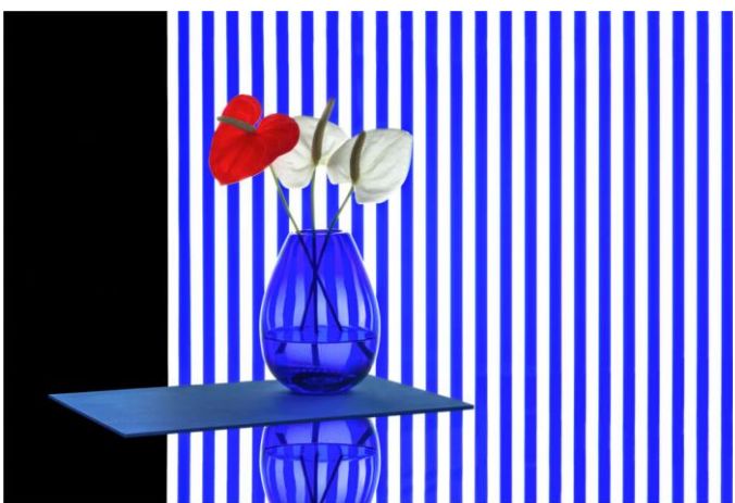
Optical Illusion Jenny Graff