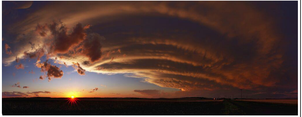
Veronica Sorley Two Sides of Weather