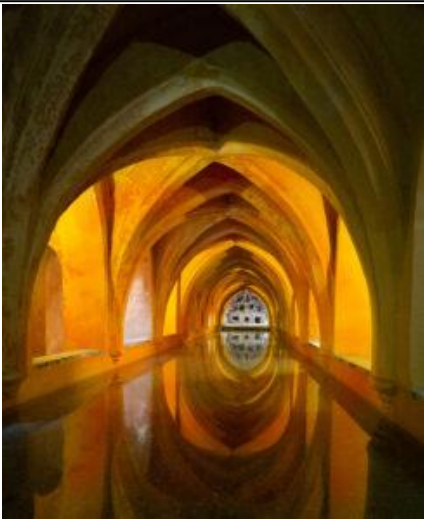
Princess Bath 14 th Century