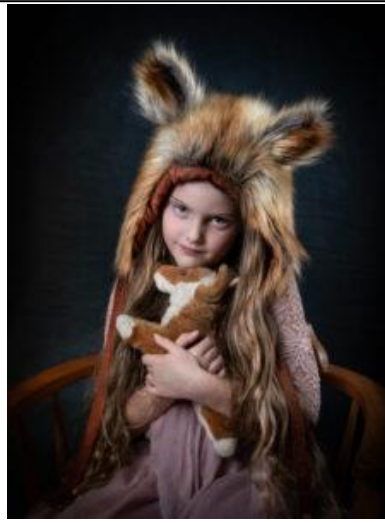
Maia and the Fox