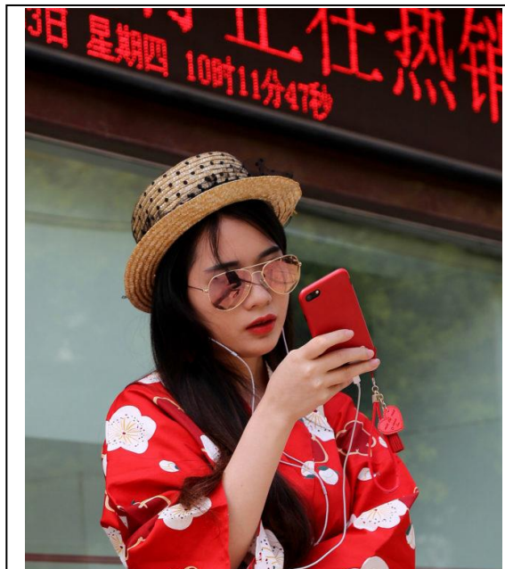
More Than a Touch of Red