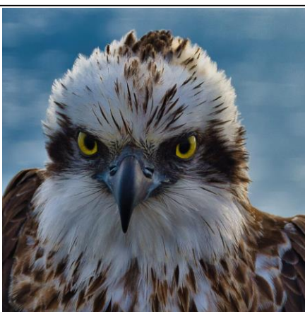
Look Into My Eyes