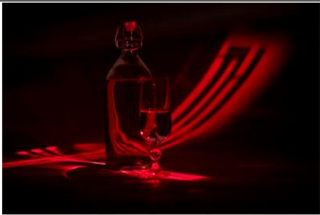
Red Red wine