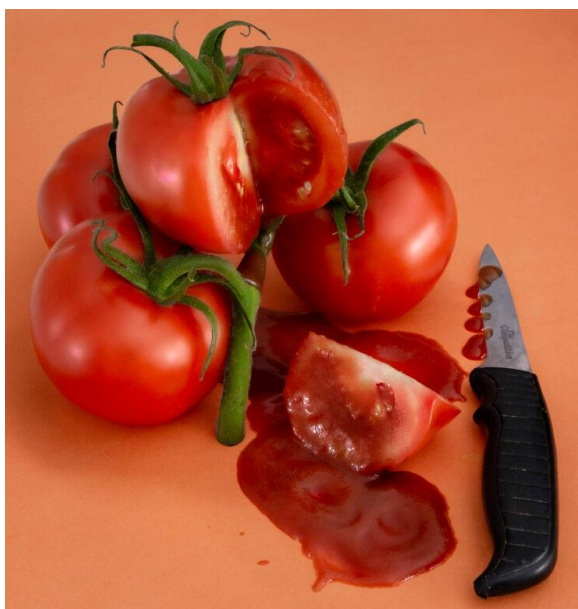
Tomato with Sauce