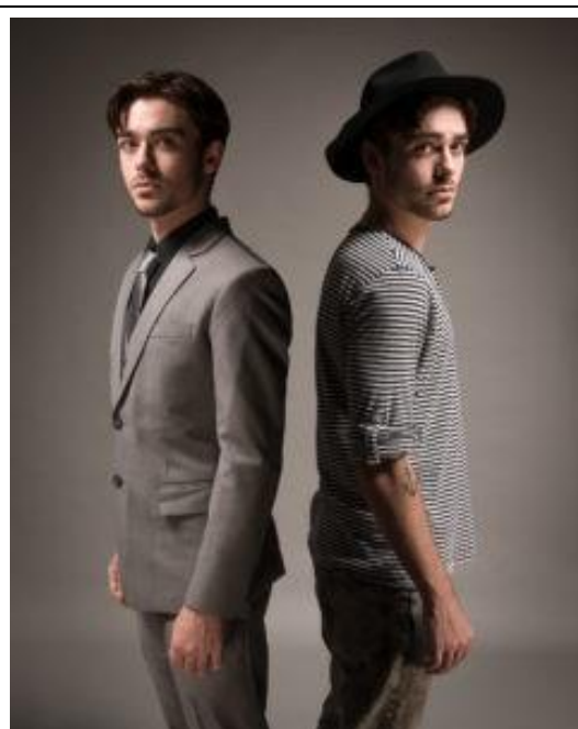
Don't Stereotype Me