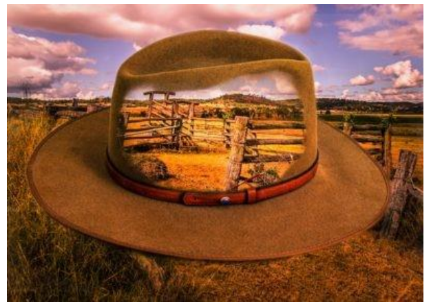
All Hat No Cattle