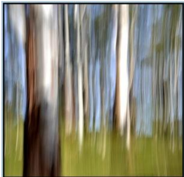
The B A Effect