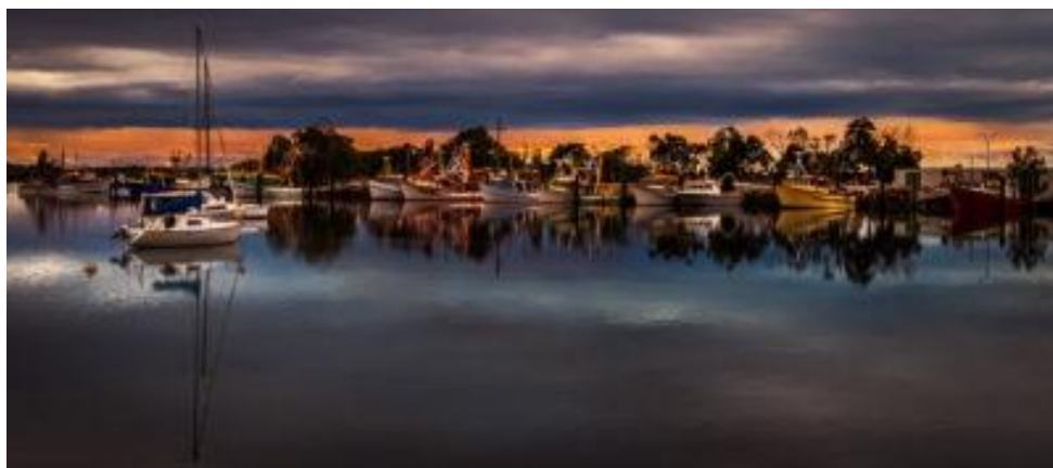
"All Quiet in the Harbour"