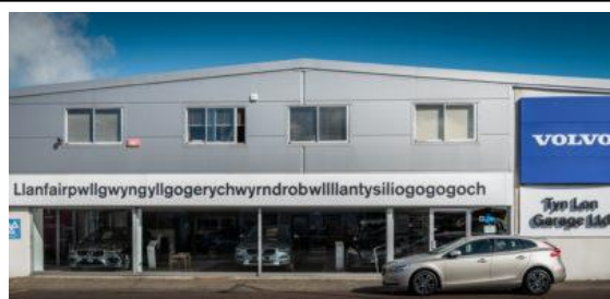
“Have a go, I Dare You”