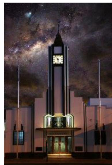
“Art deco by Night”